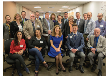
Governor Lamont's Transition Committee on Energy.